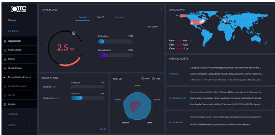
Figure 1: Example of NAVIGATOR's dashboard for a centralised view of cyber maturity across the organisation

To learn more about ITC Secure, please visit www.itcsecure.com or email us enquiries@itcsecure.com