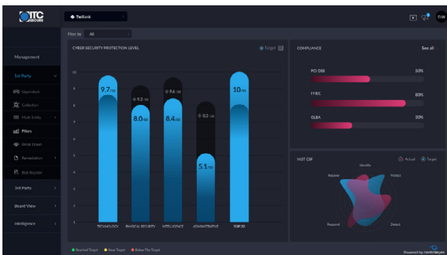
Figure 2: Example of NAVIGATOR's remediation actions dashboard